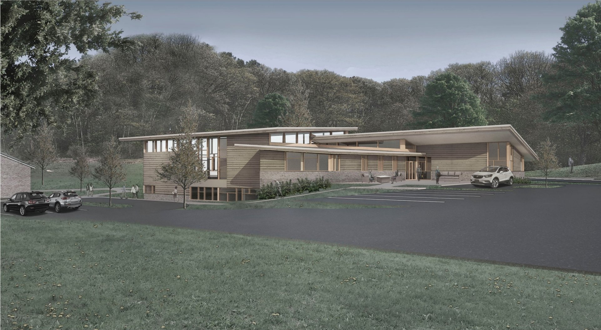
VIEW OF ENTRY