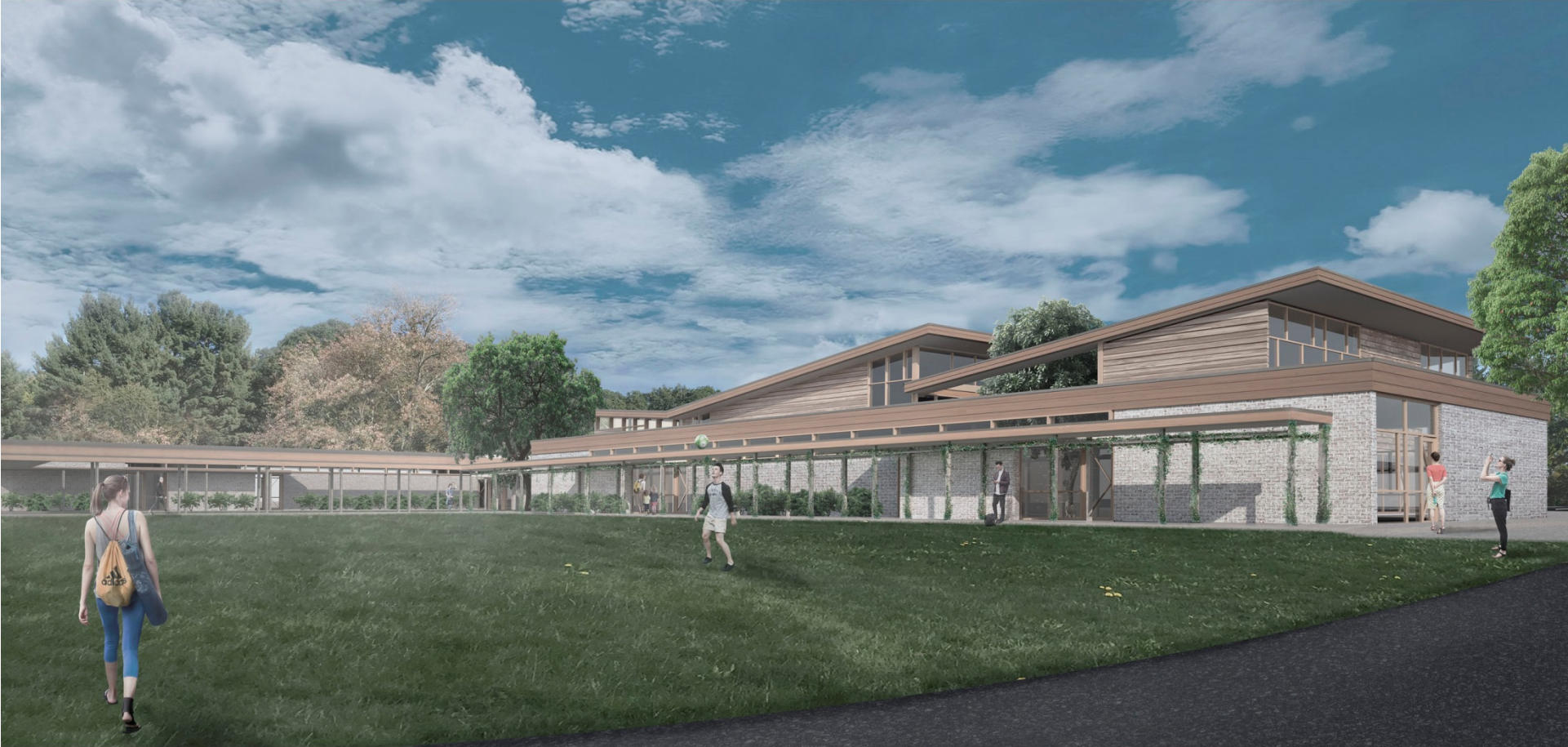
VIEW FROM HARTWELL GREEN